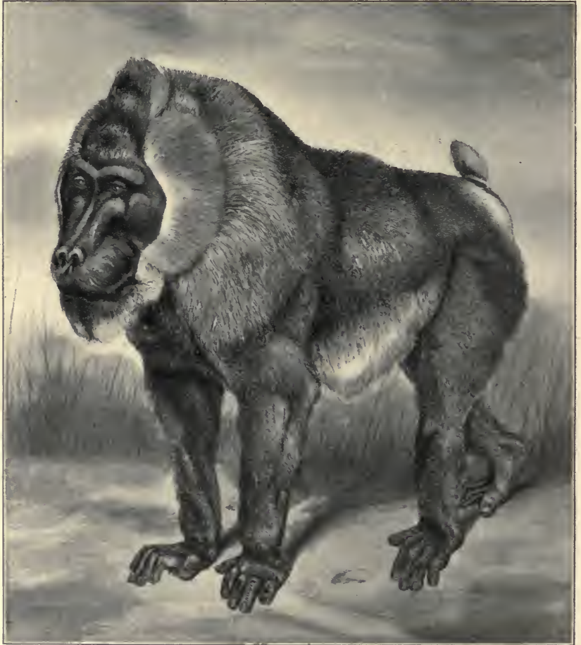
FIG. LXXXVII. PAPIO LEUCOPHÆUS. THE DRILL.

Chæropithecus leucophæus Gray, Cat. Monkeys, Lemurs & Fruit-eating Bats Brit. Mus., 1870, p. 35.